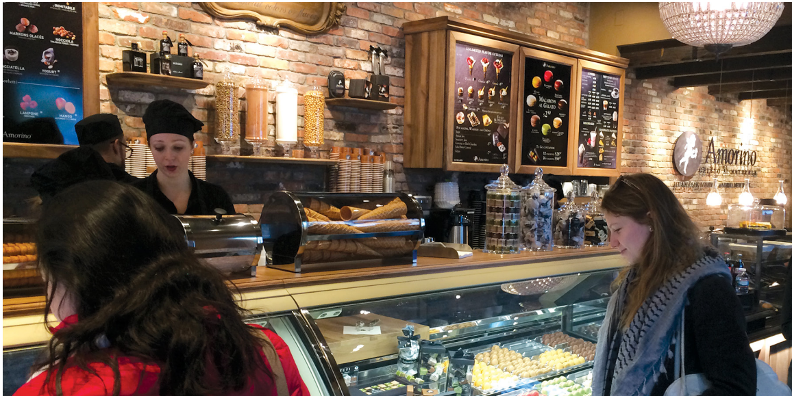
Amorino Gelateria interior