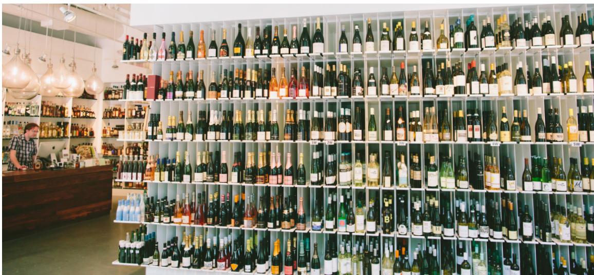
Urban Grape Interior